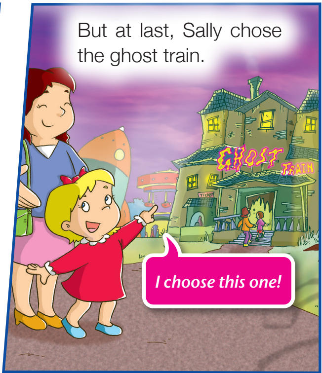
I choose this one!