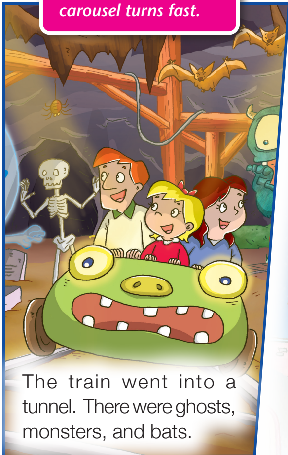
The train went into a tunnel. There were ghosts, monsters, and bats.

It was time to go home. But Sally got lost. She was locked in the park all alone.