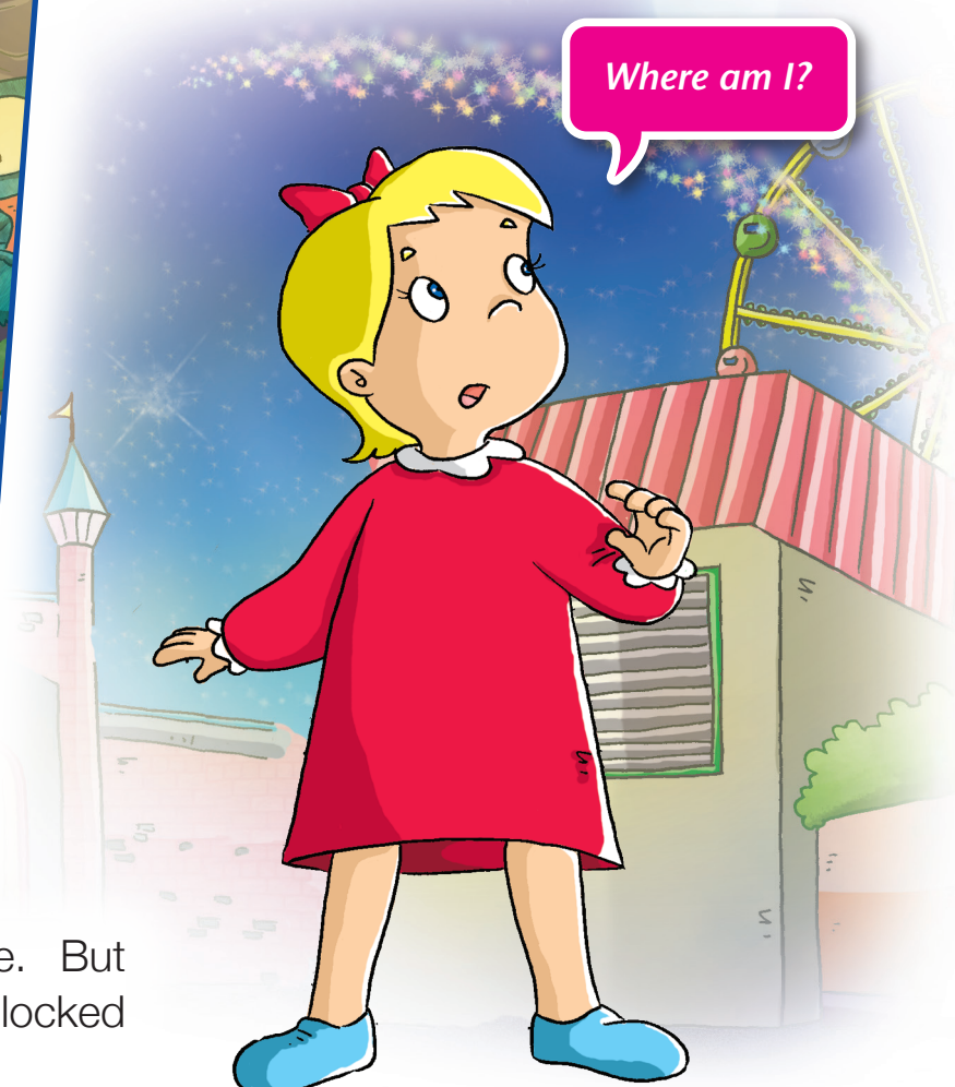
Where am I?

It was time to go home. But Sally got lost. She was locked in the park all alone.